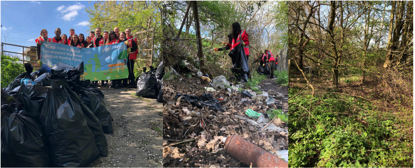
Team from Coca Cola helped us litter picking the area which made a huge difference.