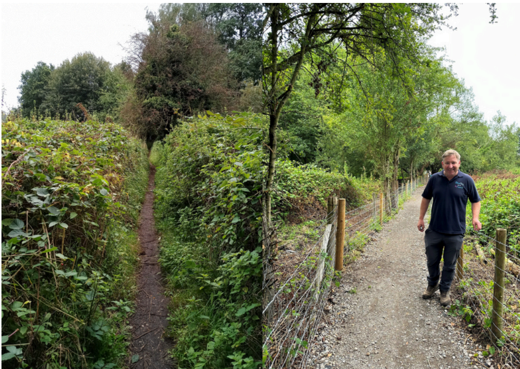
Phase two of footpath work - Before and after photo