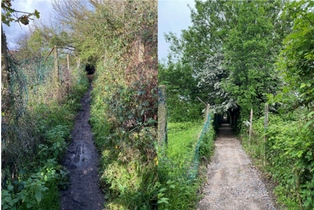
Phase one of footpath work - Before and after photo

Please see below before and after photos of the work and volunteer activities through this project.