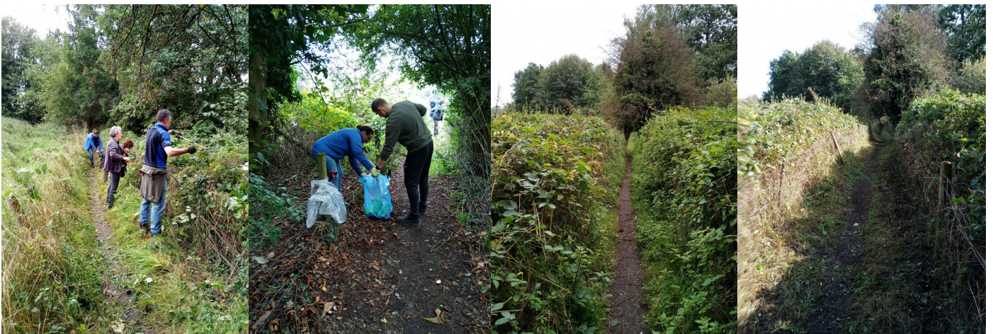
Grundon played a big part in the success of this project by donating funds to help us complete Phase 2, as well as lending a helping hand with a team of volunteers.